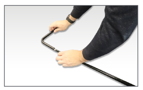
Step 1: Unpack the carry bag and assemble the flag pole by joining the seperate pieces together. Simply insert one end of the pole into the other and push them together starting with the largest to the smallest. The horizontal pole (with the right angle bend) should be at the top.