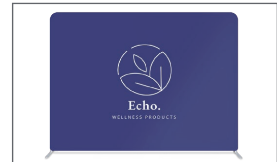
Step 6: You should now have a great looking Stretch Fabric Media Wall!