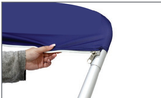
Step 4: Unzip the bottom of your banner and begin feeding the banner over the pole set. Start in one corner and then move onto the next corner. Then evenly pull the entire banner to the bottom of the pole set.