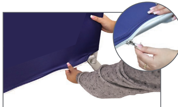
Step 5: Finally, pull the banner down tightly. This step is much easier with some assistance. So ask a friend if they can connect the zipper and begin closing the zipper, while you maintain tension on the banner.