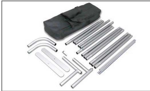
Step 1: Unpack all the contents of the carry bag.