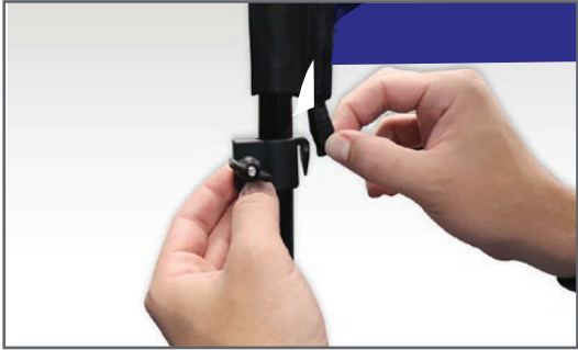
Step 4: Attach the fabric loop to the hook on the locking mechanism.