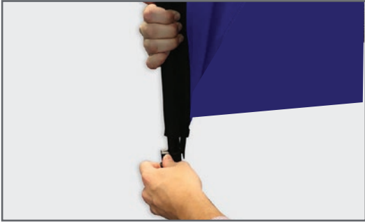
Step 5: Pull down the flag to the right tension.