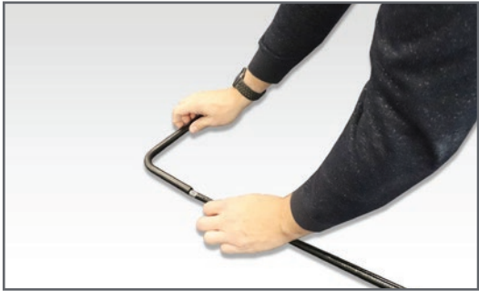
Step 1: Unpack the carry bag and assemble the flag pole by joining the separate pieces together. Simply insert one end of the pole into the other and push them together starting with the largest to the smallest. The horizontal pole (with the right angle bend) should be at