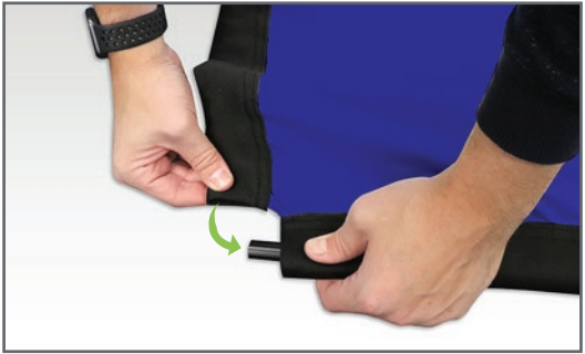
Step 3: When you have reached the corner gap, continue weaving the fabric through the pole. Keep pushing the pole and pulling the fabric down until you reach the locking mechanism.